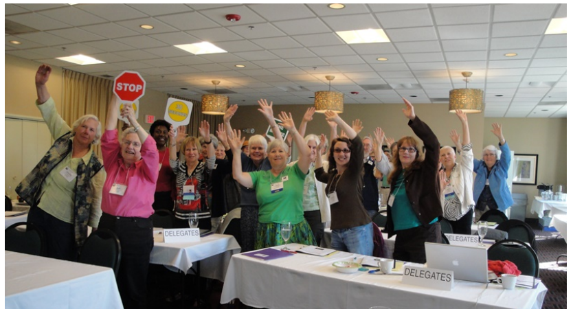
Fun at Council: Leaguers are an enthusiastic group!