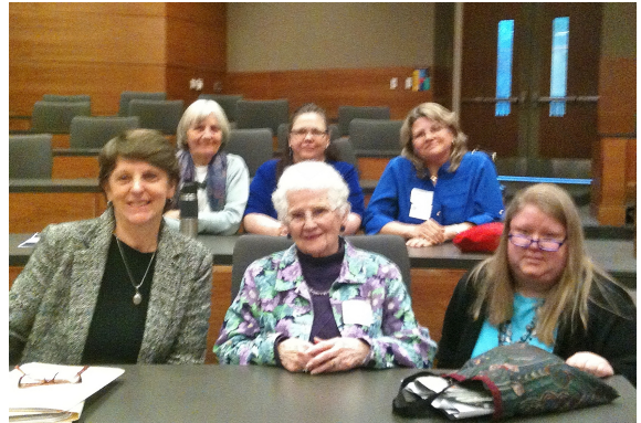
Oregon and Washington League members share a moment at the Pacific Northwest Regional Hearing of the National Commission on Voting Rights

Even though we, as League leaders, consider ourselves to be knowledgeable about voting issues, it was still an eye-opening experience to learn about the wide range of voting barriers that still exist, particularly for minorities, ex-felons, and the disabled. What was gratifying, however, was hearing about steps currently underway to better educate citizens about their voting rights, to use technology in innovative ways, and to litigate when necessary to effect change. One of the best parts of the event was the opportunity for League members from neighboring states to share information and to get to know each other a bit better. We were reminded that it pays to work together, and we even tossed around the idea of having a joint LWV Oregon/Washington Council meeting in the near future.