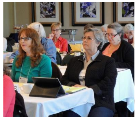
Local League delegates at Council